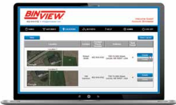
Location view on a PC