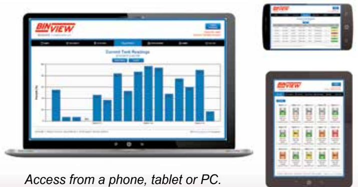
Access from a phone, tablet or PC.

and is accessible from any device with a connection to the internet. Real-time inventory management and automated alerts can be accessed from a Smartphone, tablet or PC. BinView offers both security and control over your assets and users of the application. Super users can have the ability to set up and manage locations, gateways, and vessels, while other users may have view-only or receive alerts-only privileges. The system can be set up so that some users have access to all sites, while others may only be able to access data for a single location.