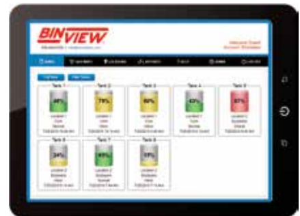
Tank view on a tablet